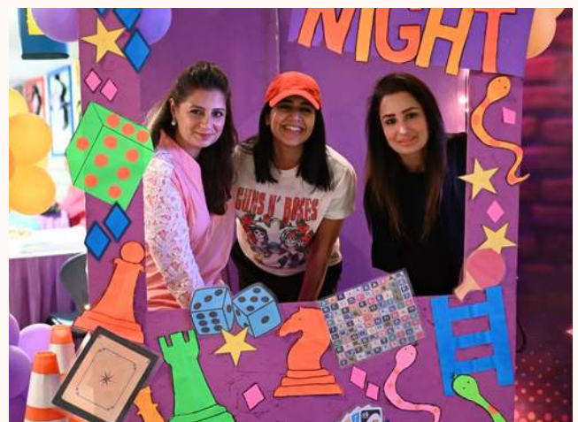
EID MILAN PARTY