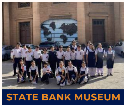
STATE BANK MUSEUM