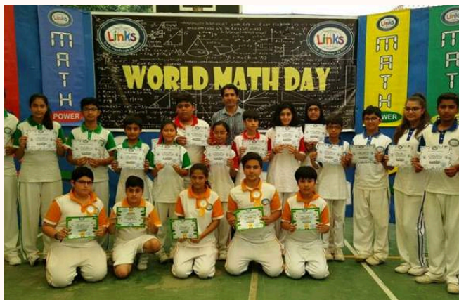
WORLD MATH DAY