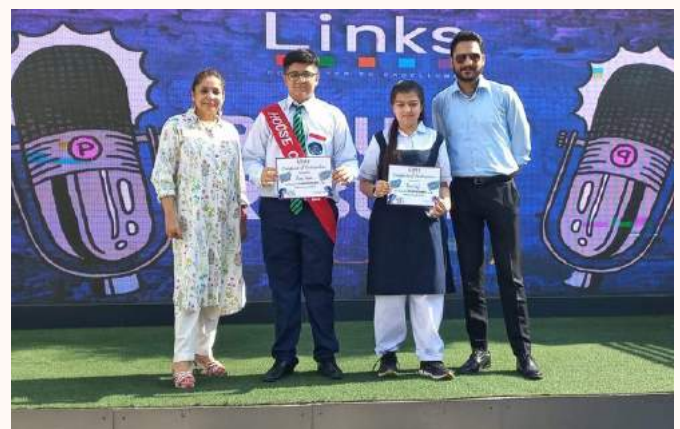
ENGLISH DEBATE CONTEST