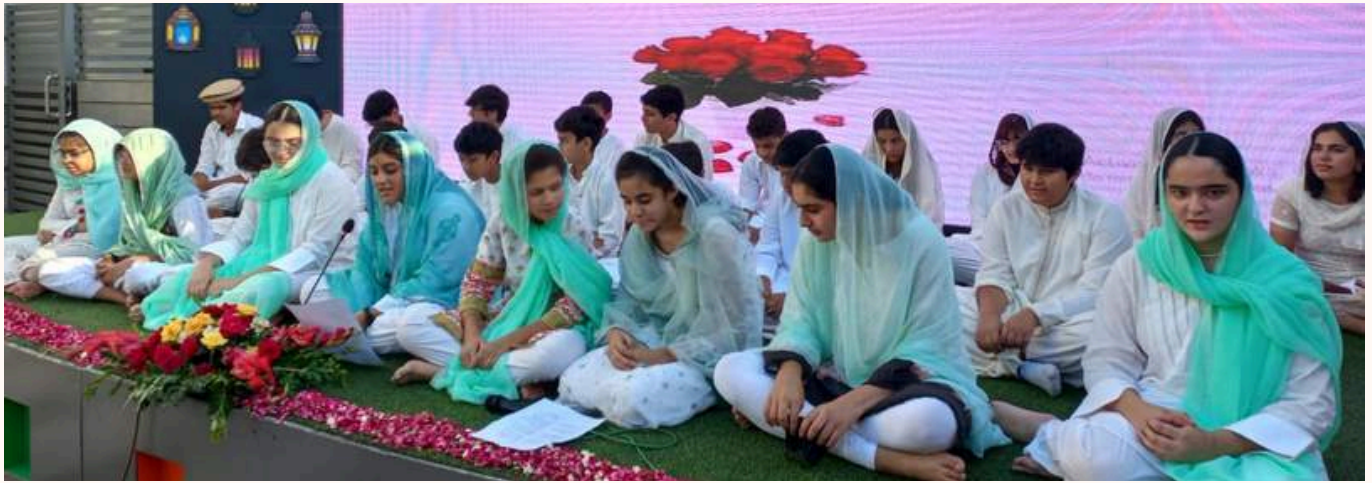
MILAD FOR EID MILAD UN NABI