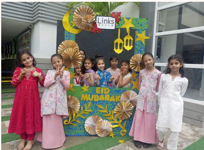
EID MILAN PARTY