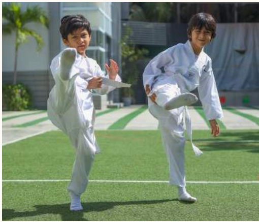
TAE KWAN DO