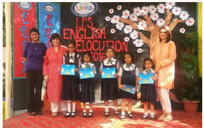
ENGLISH ELOCUTION CONTEST