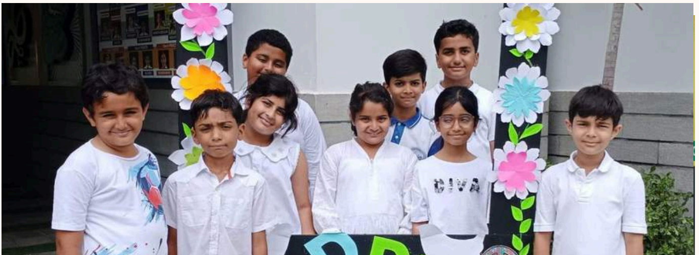
WORLD PEACE DAY